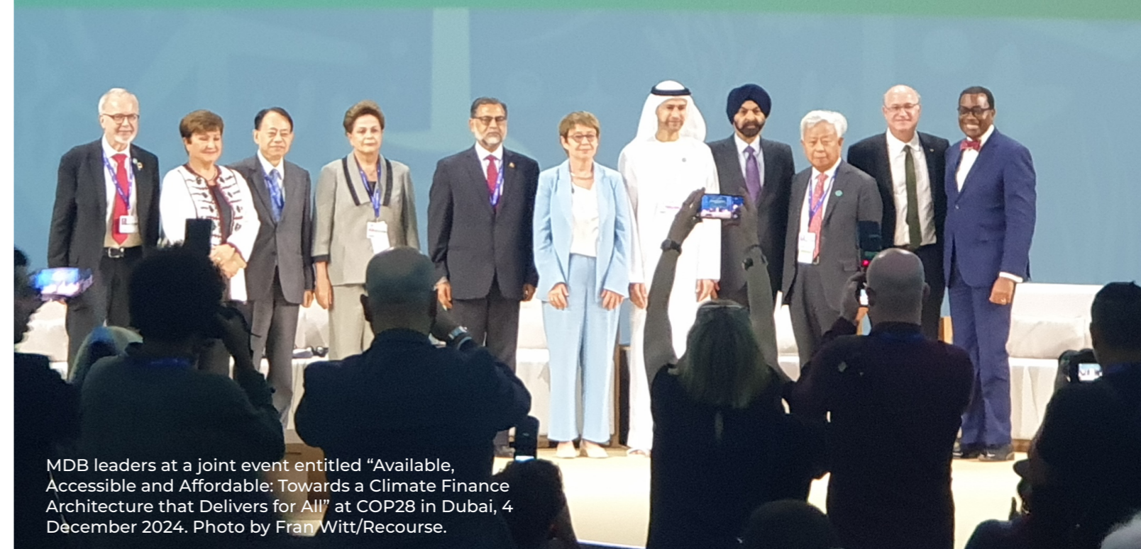
MDB leaders at a joint event entitled "Available, Accessible and Affordable: Towards a Climate Finance Architecture that Delivers for All" at COP28 in Dubai, 4 December 2024.

AVAILABLE, ACCESSIBLE AND AFFORDABLE TOWARDS A CLIMATE FINANCE ARCHITECTURE DELIVERS FOR ALL