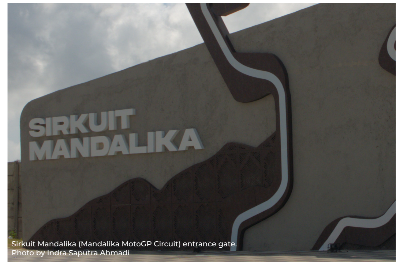
Sirkuit Mandalika (Mandalika MotoGP Circuit) entrance gate.

Mongabay (2023). Indonesia's Mandalika project: A litany of violations for indigenous Sasak. Retrieved from https://news.mongabay.com/2023/10/indonesias-mandalika-project-a-litany-of-violations-for-indigenous-sasak/